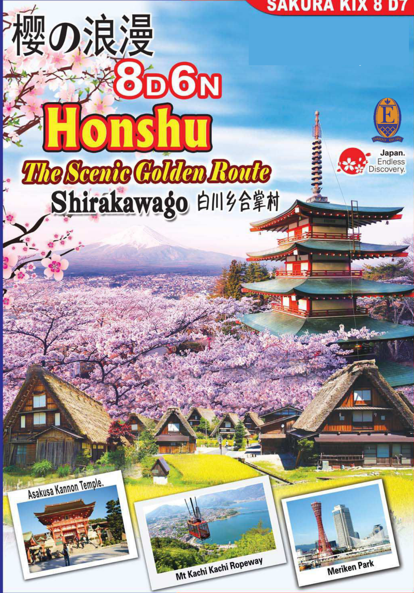
Asakusa Kannon Temple.